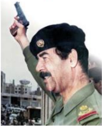
Iraqi dictator Saddam Hussein poses with a gun for his personal photographer. ▼